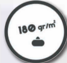
light and transportable