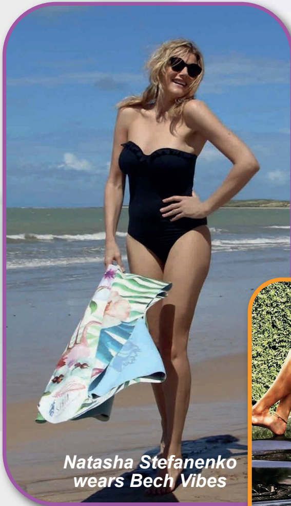
Natasha Stefanenko wears Bech Vibes

Creation of visual material: postcards, catalogs, exhibitors, brochures, shop signs