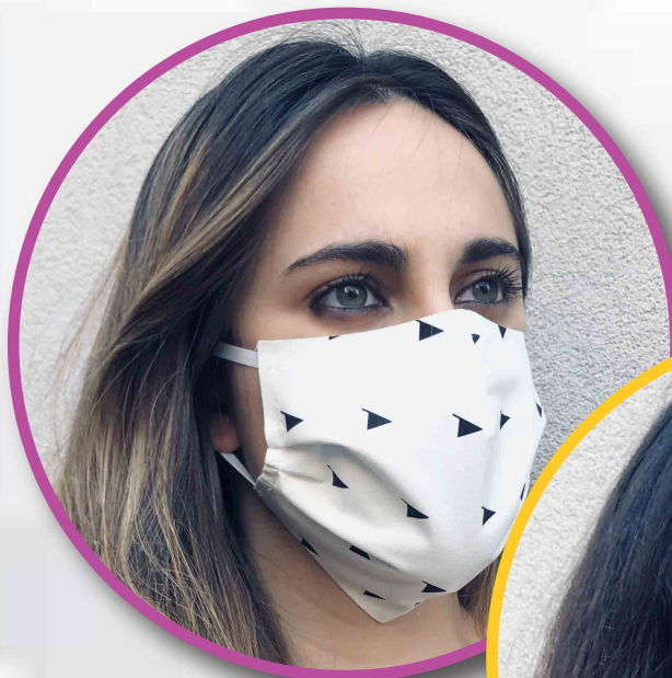
comfortable to wear