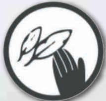
respect the skin